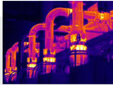
MultiSharp™ Focus, available on the Ti450.